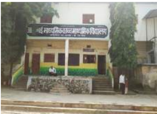
Moha, Parli District