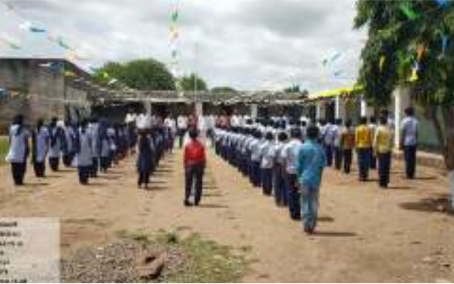
Goverdhan, Parli District