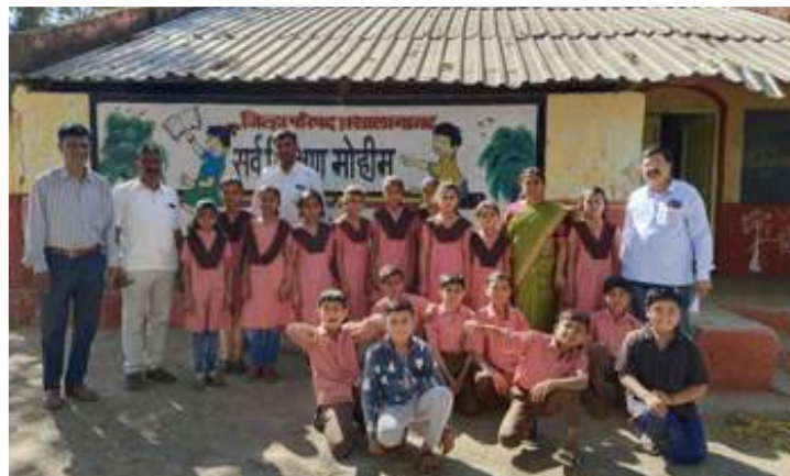
ZP Prathmik Shala Bhawali