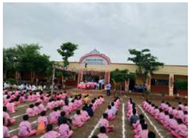
Waghala, Parli District