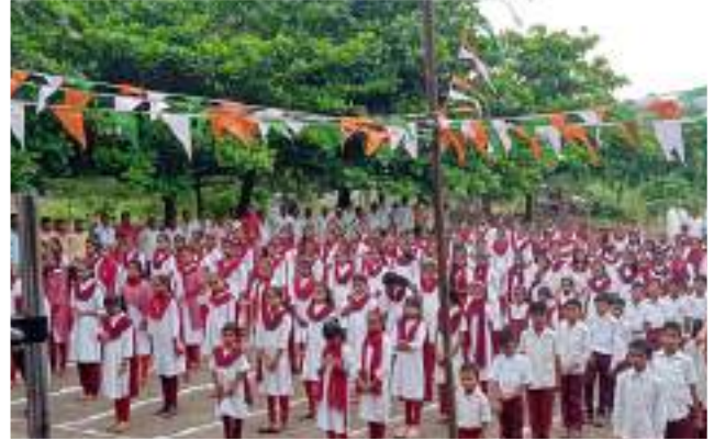
Manekhel, Parli District