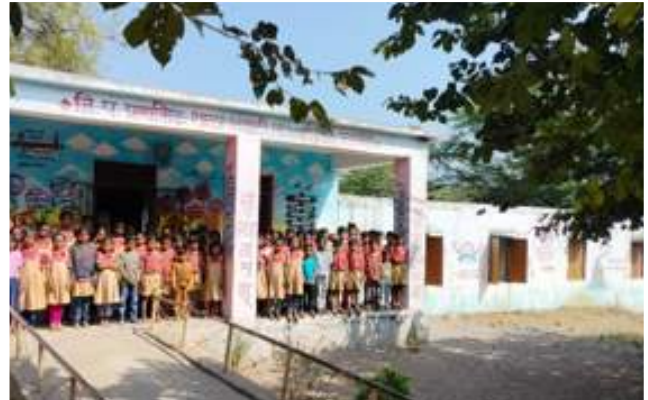
ZP Prathmik Shala Bhawali