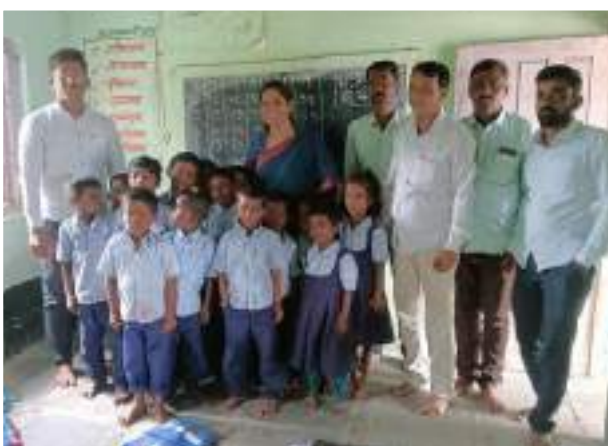
ZP Uchch Prathmik Shala, Wakdi