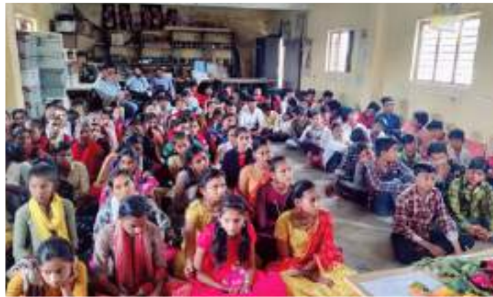
Kaudgaon, Parli District